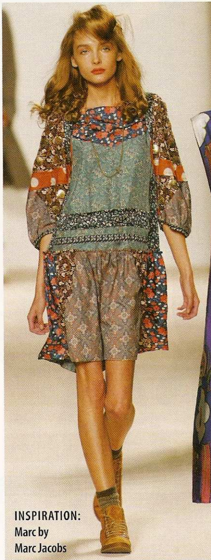
INSPIRATION: Marc by Marc Jacobs

Creator of magical prints and icon of the swinging Sixties, Celia Birtwell has led a wildly fashionable life. Her kaleidoscopic designs adorned husband Ossie Clarke's clothes and became as emblematic as the stars who wore them. Now, with Birtwell-inspired dresses on the catwalks at Marc by Marc Jacobs and Etro, and a collaboration with TopShop, her work is as influential as ever.