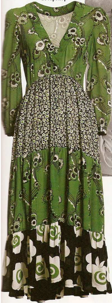
Cotton-mix dress, £65, Celia Birtwell at TopShop