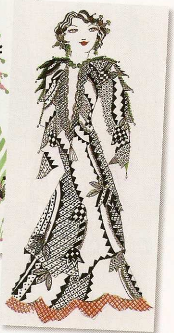
WORK IN PROGRESS: Celia's sketches for TopShop's range