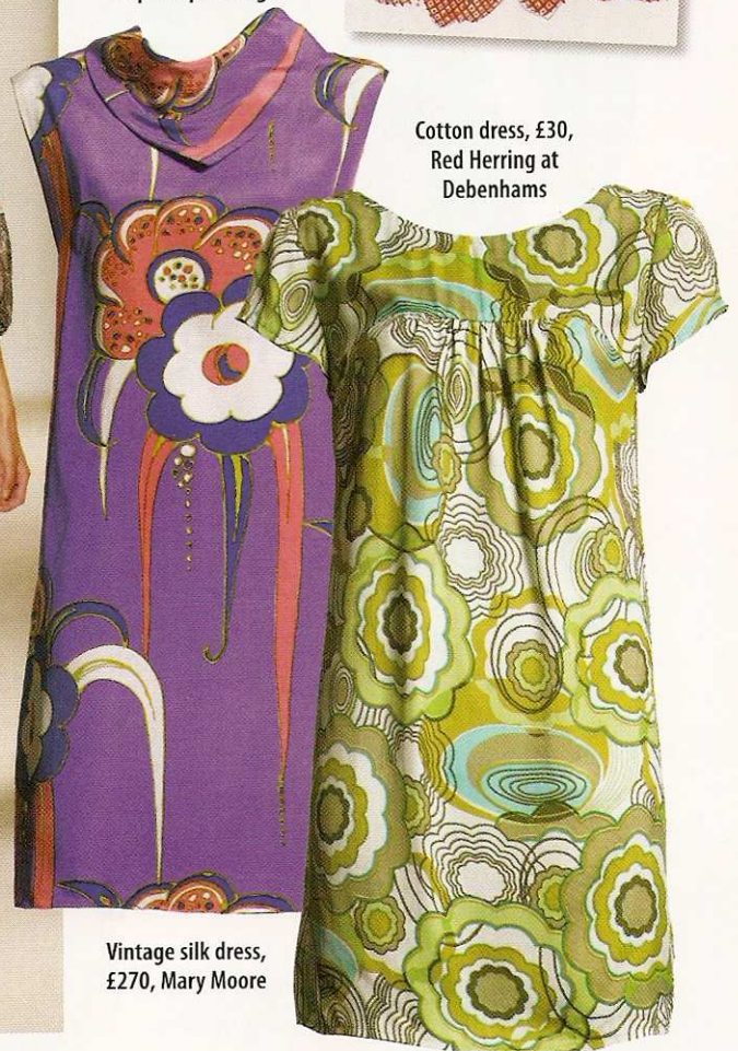
Cotton dress, £30, Red Herring at Debenhams