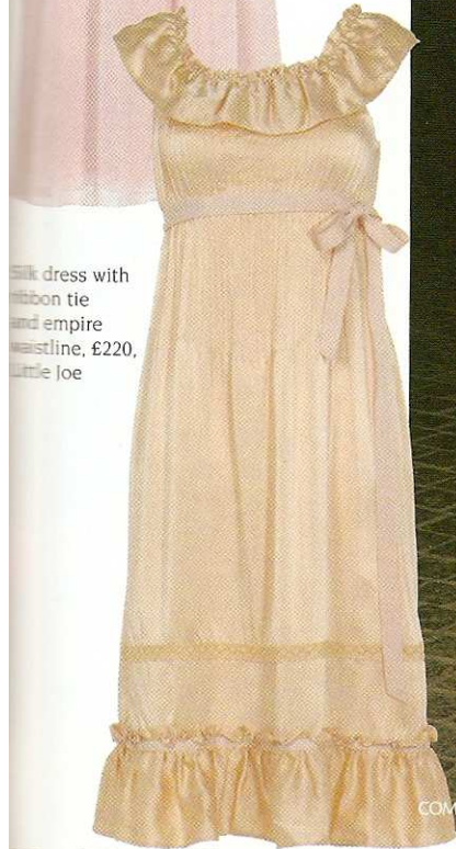
Silk dress with ribbon tie and empire waistline, £220, Little Joe