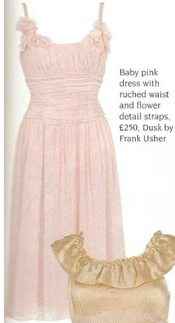
Baby pink dress with ruched waist and flower detail straps, £250, Dusk by Frank Usher