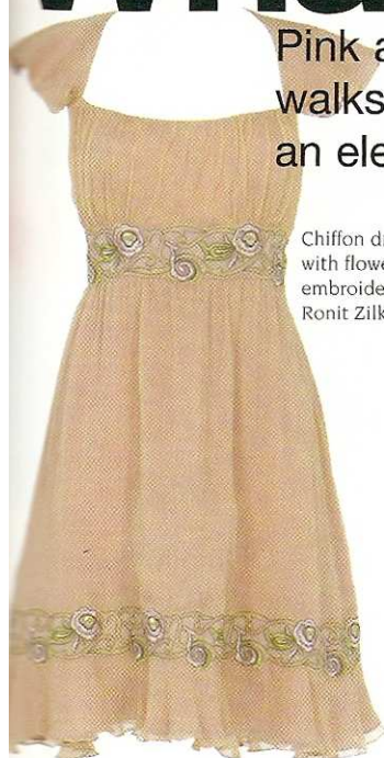
Chiffon dress with flower embroidery, £349, Ronit Zilka